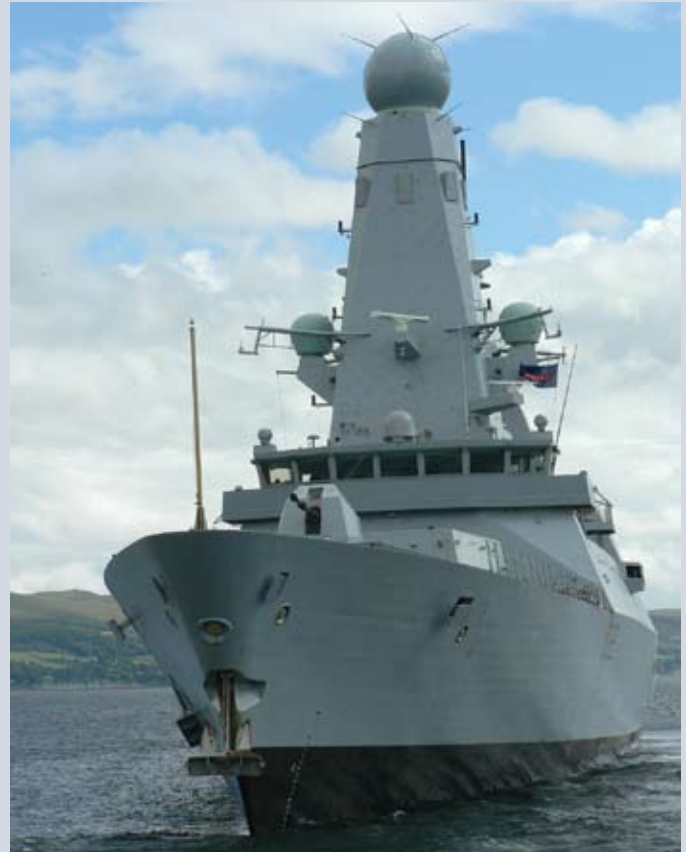
HMS DARING on 2007 Sea Trials with all relevant Naval Authority Certification in Place

The NAS was originally developed by BMT to manage its activities when acting as a Recognised Organisation, as delegated by UK MoD Naval Authorities. Since its inception the system has steadily evolved, through the continual requirement capture process with key personnel in the both Naval Authority and wider user communities. The NAS is an RLI web application that utilises ASP.NET and SQL Server 2000 to produce a fully dynamic and interactive web application that exploits the latest technologies whilst remaining compatible with MoD IT policies.